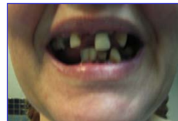
Patient before her dental work in Tijuana

To make a long story short, all those teeth rotted out over the next couple of years and I had to have them pulled. So by 1996 I had no teeth on the bottom right side, and no teeth on the top left side. I couldn't chew. The teeth I did have were used improperly and did not allow me to chew properly. By the time I returned from teaching in India in 2000, my remaining teeth were beginning to rot.